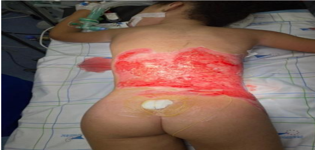
Fig. 1: An extensive burn involving the back and trunk in a 6-year-old girl.