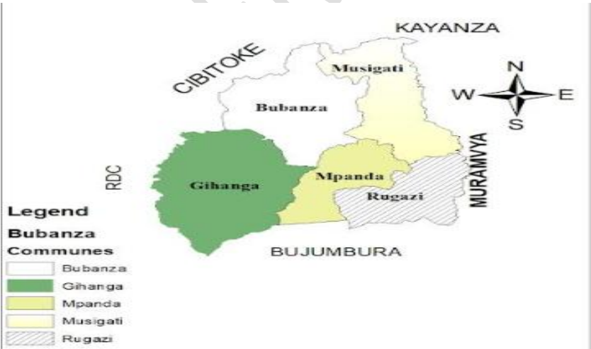
Figure 1. Map of the commune of Gihanga

The study was carried out among sweet potato growers in the commune of Gihanga, province of Bubanza on April 2023. The commune of Gihanga was chosen because it is one of the sites where orange-fleshed sweet potato cuttings have been widely distributed. The commune was also chosen because it is one of the areas with the greatest potential for sweet potato production. In addition, it has been the area for the introduction of improved sweetpotato varieties by ISABU and FAO for almost four years, with 403,000 orange-fleshed sweetpotato cuttings distributed (ISABU, 2019). Six of eleven distribution sites in the Gihanga commune were selected. These were the sites of, Gihungwe, Rugunga, Gihanga, Bwiza bwa Ninga V6, Ninga V4 and Buringa using a simple random sampling technique.