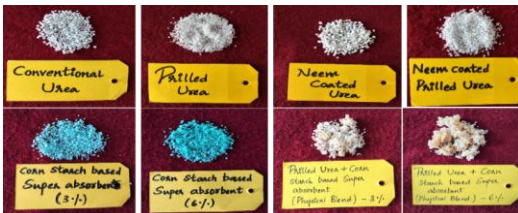
Plate 1: Different types of urea fertilizers

Experiment on leaching loss of N from various N sources that applied to soil was conducted under greenhouse condition. Known amount of similar size pots were cleaned and a hole was made just contiguous to bottom surface. A tube having 1.50 cm diameter was tightly fixed to the hole using L-bow joint with rubber case to enable leachate collection without leakage. To each pot air dried and sieved soil was added with maintaining bulk density.