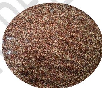
Hot air oven (100°C/1 h)