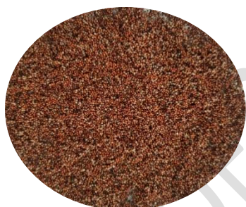
Finger millet (Control)