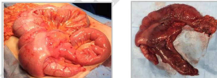
Figure 2: Ileocolic intussusception Figure 3: Operative specimen

Exploratory laparotomy was proposed, which the patient accepted. Intraoperatively, ileocolic invagination with a possible appendicular tumor was confirmed (figure 2). Formal right hemicolectomy was performed, with oncological intent (figure 3).