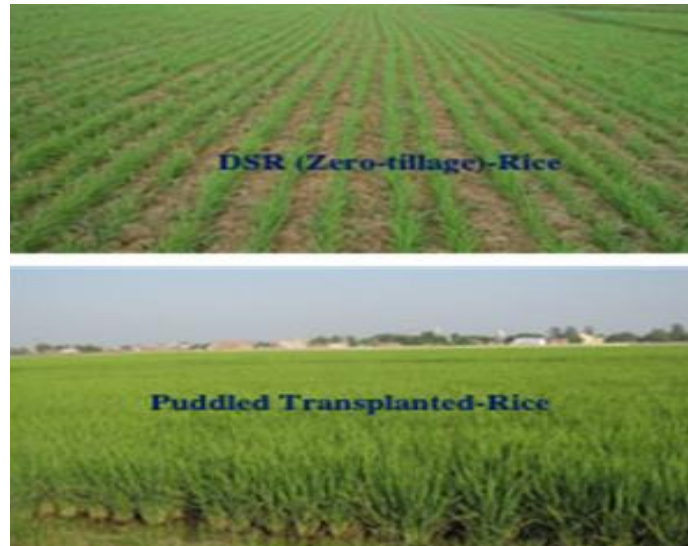
Figure 2. Different methods of rice crop production in the IGP region