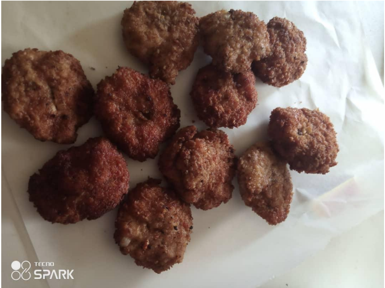
Figure 2. Sample of freshly produced chicken nugget