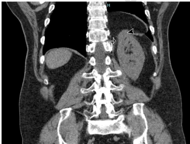
Figure 2: Coronal chest tomography displaying a left diaphragmatic defect (→) with the superior renal pole protruding through it (▶). There was no dilatation or evidence of stones.

Chest tomography revealed a left diaphragmatic defect through which the omental contents protruded, and part of the superior renal pole was contained (figure 2). Compared to the ipsilateral kidney, the left adrenal gland was seen to be situated lower and medially (figure 3).