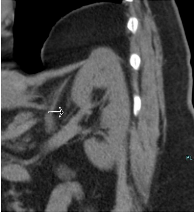
Figure 3. Oblique chest tomography reconstruction showing the left adrenal gland in a medial and inferior displacement relative to its anatomical position(→) while renal vessels are normal.