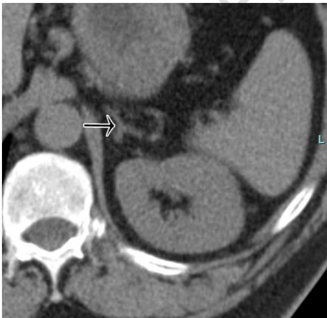
Figure 4. Abdominal CT showing the left adrenal gland in a medial and displaced position towards the interpolar region (→)