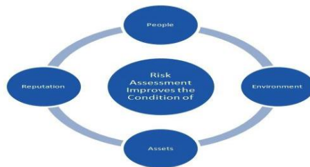
Figure 2: Risk Assessment to improve the four (PEAR) elements (Source: [20])

Risk assessment entails identifying risks, analyzing them, and using the insights gained to evaluate risk by drawing conclusions about their relative significance in relation to the organization's objectives and performance thresholds. This process helps to inform decisions about whether treatment is required, treatment priorities, and risk-reduction actions [20].