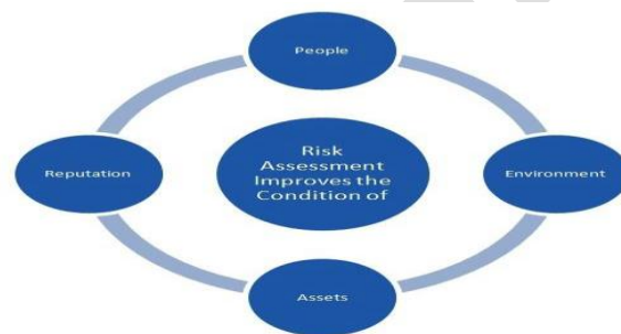
Figure 2: Risk Assessment to improve the four (PEAR) elements

Risk assessment entails identifying risks, analyzing them, and using the insights gained to evaluate risk by drawing conclusions about their relative significance in relation to the organization's objectives and performance thresholds. This process helps to inform decisions about whether treatment is required, treatment priorities, and risk-reduction actions [20].