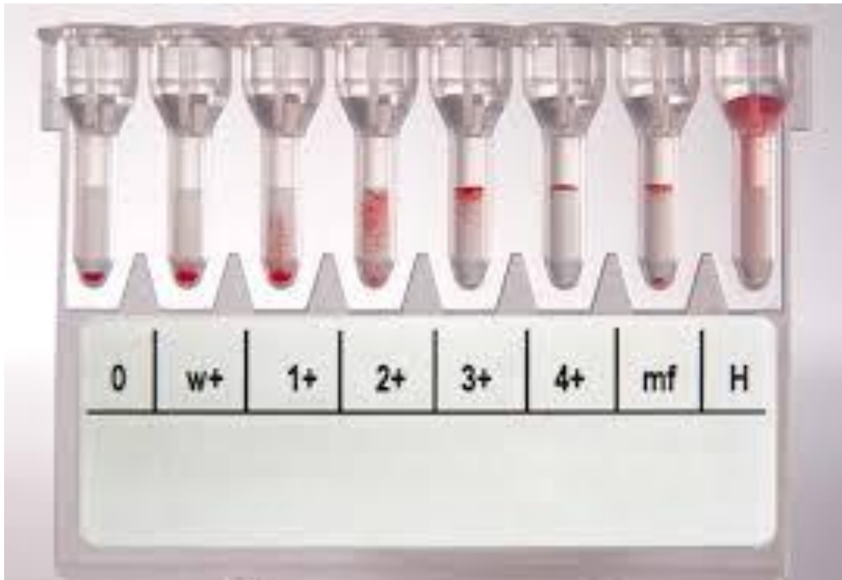
Figure 2: Semiquantitative scoring system for agglutination interpretation

0 Negative: well-defined pellet of non-agglutinated red blood cells at the bottom of the gel column and no visible agglutinated cells in the rest of the gel column. Weak reactivity: w+ Barely visible small-sized clumps of agglutinated cells in the lower part of the gel column and a pellet of unagglutinated cells at the bottom. Reactivity 1+ Some small-sized clumps of agglutinated cells most frequently in the lower half of the gel column. A small pellet may also be observed at the bottom of the gel column. 2+ Reactivity Small or medium-sized clumps of agglutinated cells throughout the gel column. A few unagglutinated cells may be visible at the bottom of the gel column. 3+ Reactivity Medium-sized clumps of agglutinated cells in the upper half of the gel column. 4+ Reactivity A well-defined band of agglutinated red blood cells in the top part gel column. A few agglutinated cells may be visible below the band. mf Mixed-field. A band of red blood cells at the top part of the gel or dispersed throughout the gel column, and a pellet in the bottom as a negative result. H Hemolysis in the microtube with very few or no red blood cells in the gel column. ff hemolysis is present in the microtube but not in the sample the reaction must be considered positive (4+).