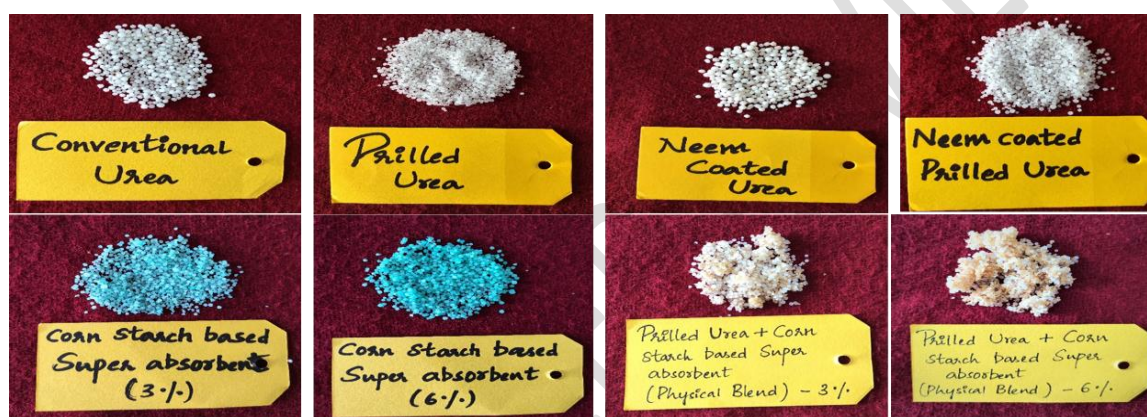
Fig 2. Different types of urea fertilizers