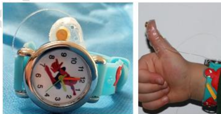
Figure (3): Extra-oral part (Thumb cover)