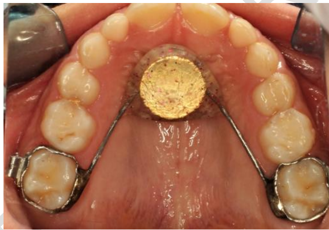
Figure (2): Intra-oral part

At the delivery day, after the proper disinfection, dryness of the appliance and the intraoral isolation, its intraoral part was cemented with glass ionmer (Medicem, PROMEDICA, Germany). The fitness of the extra-oral part (clear thumb cover) was checked on the thumb. The patient was given the instructions particularly using plastic spoon during eating.