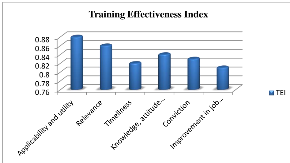
Fig 1 Average training effectiveness index of different parameters