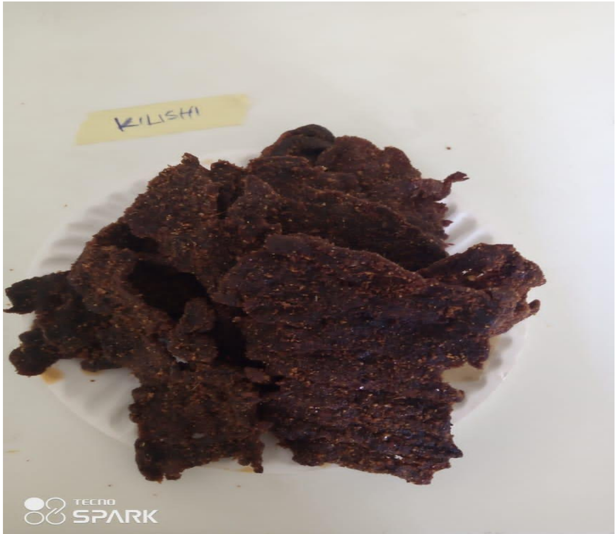
Figure 2. Product sample of Sun Dried Kilishii