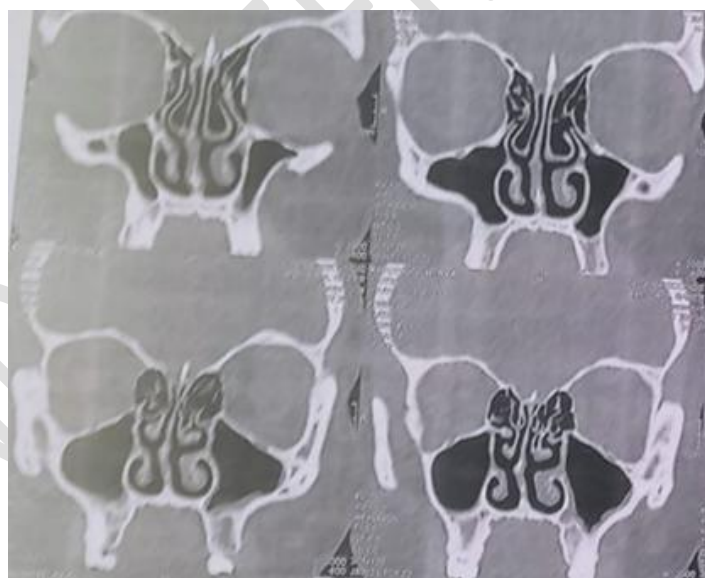
Figure 3: Blondeau scan in favour of a deviated nasal septum.