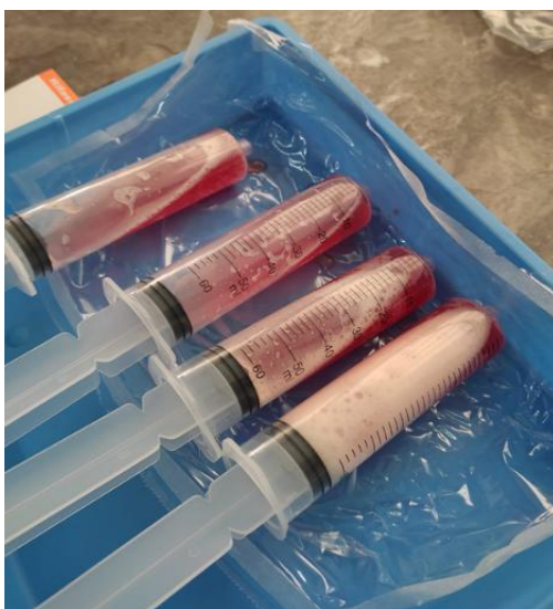
Figure 2: Macroscopic appearance of frankly haemorrhagic bronchoalveolar lavage.