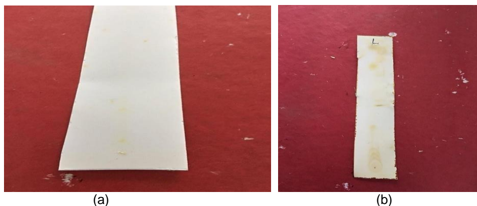
Fig. 5. TLC plates of carotene developed in benzene solution (a), and iodine chamber (b)

The conventional solvent extraction and anti-solvent processes are feasible methods to rapidly extract lycopene from tomatoes. When using the anti-solvent method to precipitate lycopene, various solvents are used to extract lycopene from tomatoes. However, in the conventional solvent extraction method, only ethyl acetate is used to extract and precipitate lycopene. Ethyl acetate is the greatest option financially because it is far less expensive than other solvents. Using chloroform, n-hexane, and methanol is more costly than using single solvent ethyl acetate. When using ethyl acetate, less time is required to precipitate lycopene. The use of the anti-solvent methanol method the extraction is not satisfactory in terms of profitability. To achieve the highest solubility of lycopene the choice of ethyl acetate as the solvent was the most reasonable.