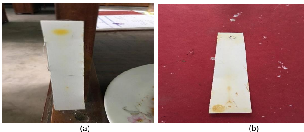
Fig. 6. TLC plates of carotene developed in benzene solution (a), and iodine chamber (b)