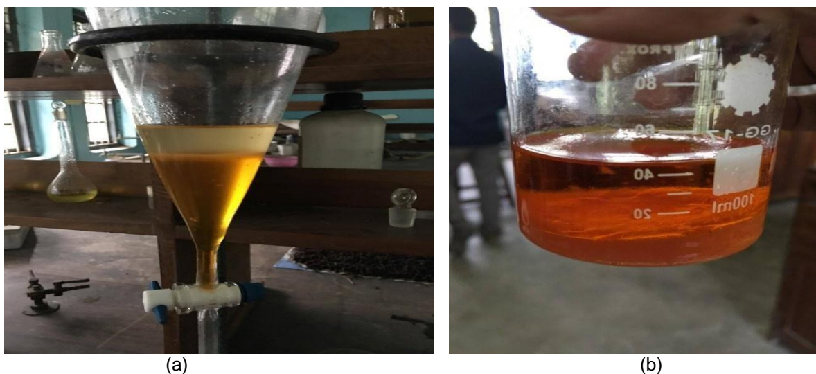
Fig. 1. Lycopene extraction and purification method (a), extracted and purified sample (b)

A Turmeric sample of proper morphotype was collected from the local market (Fulbaria, Mymensingh). Turmeric was sun-dried and torn into pieces and then extracted for curcumin by the Alkalization method (the act of making a substance alkaline, as through the addition of a base NaOH). The extracted curcumin was precipitated at low pH (diluted HCL) as soon as possible by proper instrumental arrangements. The curcumin precipitate was coagulated and filtered under a vacuum. The curcumin powder thus obtained was treated by proper solvent extraction method (n-hexane) for removal of gum, oil, resin, etc. The final step is drying the extract and grinding to obtain powder form. Curcumin extraction and purification method (a), extracted and purified sample (b) shown in Fig. 3.