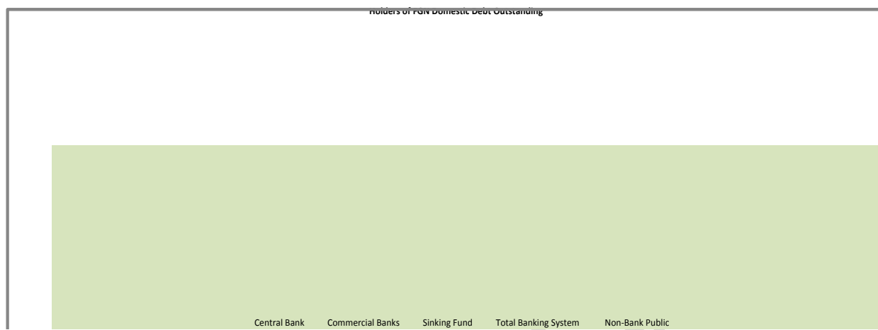
Figure 2: Holders of Federal Government Domestic Debt