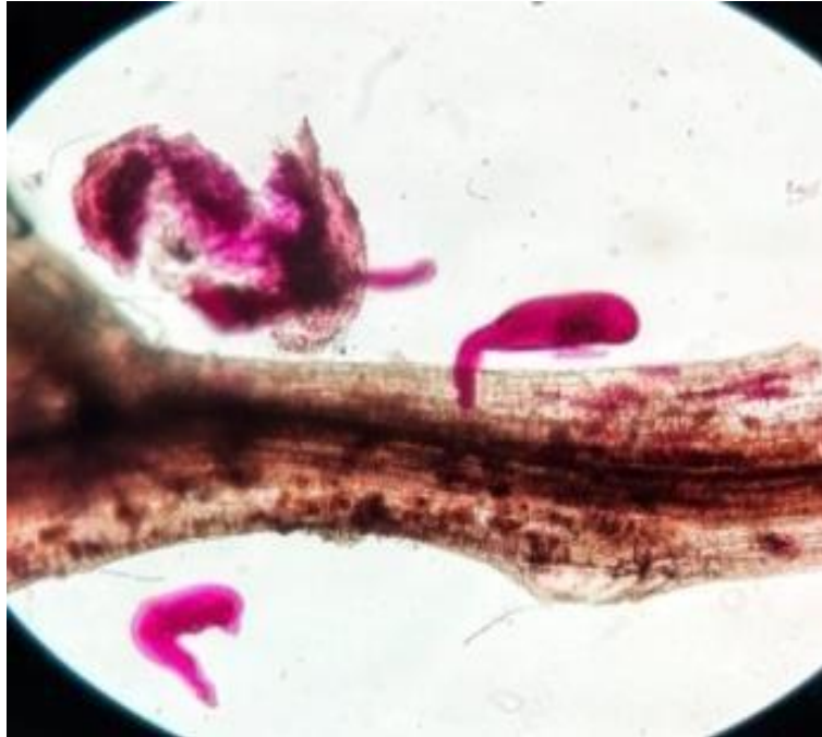
Fig. 2. Reniform nematode