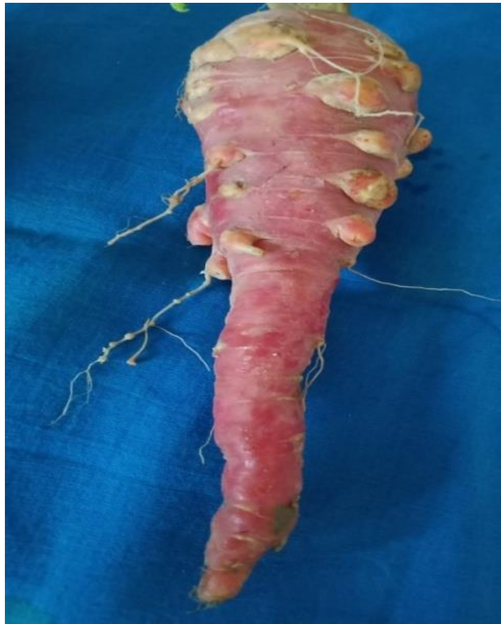
Fig. 3. Root-knot nematode infested carrot