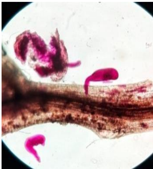
Fig.2. Reniform nematode