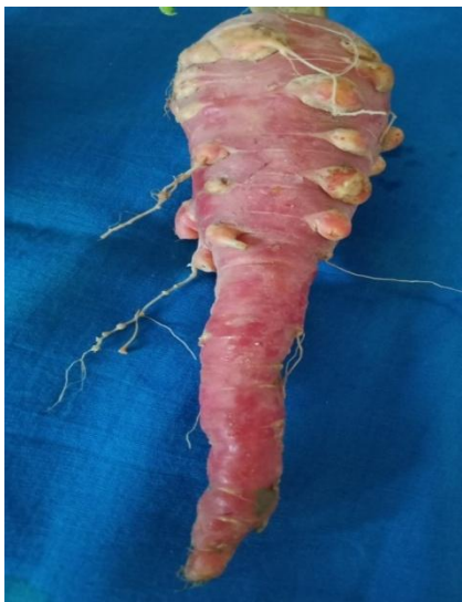
Fig.3. Root-knot nematode infested carrot