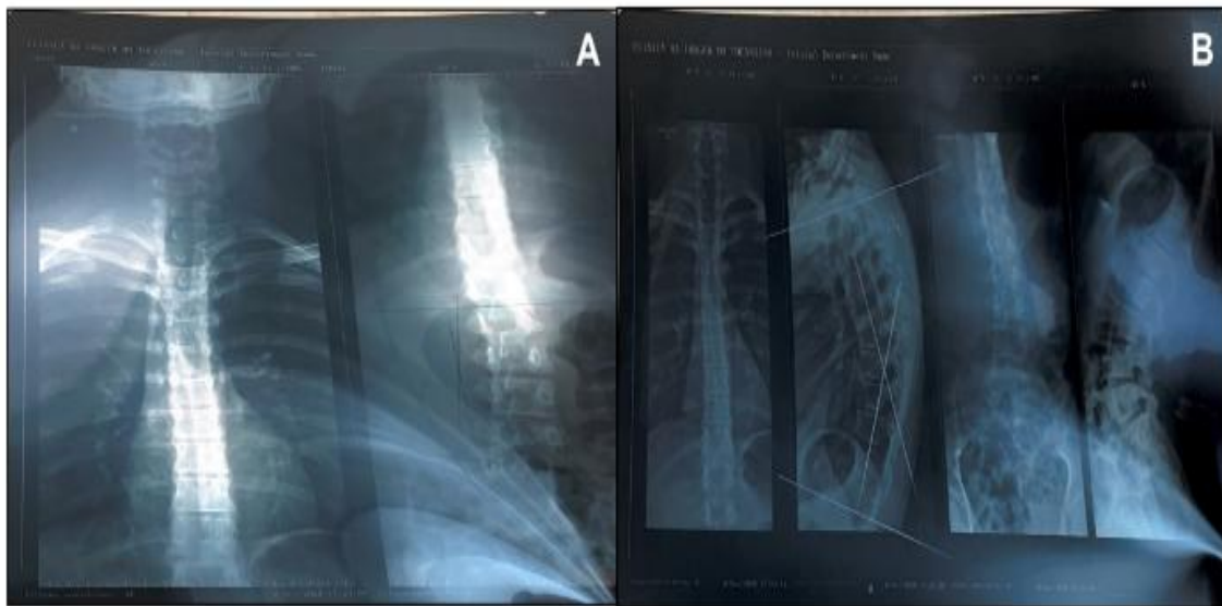
Fig. 2. Radiological evaluation of the case

Legend: A) Scoliosis X-ray; (B) X-ray of thoracic kyphosis