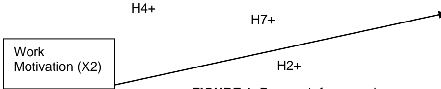
FIGURE 1. Research framework