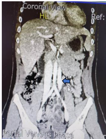
Figure 1: Double IVC ran upwards bilaterally to the abdominal aorta. Abnormally located IVC pointed with blue arrow run on the left side of the aorta.

Otherwise, he is asymptomatic for the double IVC, and the splenic injury was successfully treated conservatively.