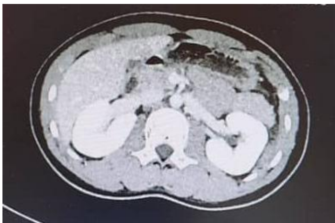
Figure 2: The left IVC terminated into the left renal vein