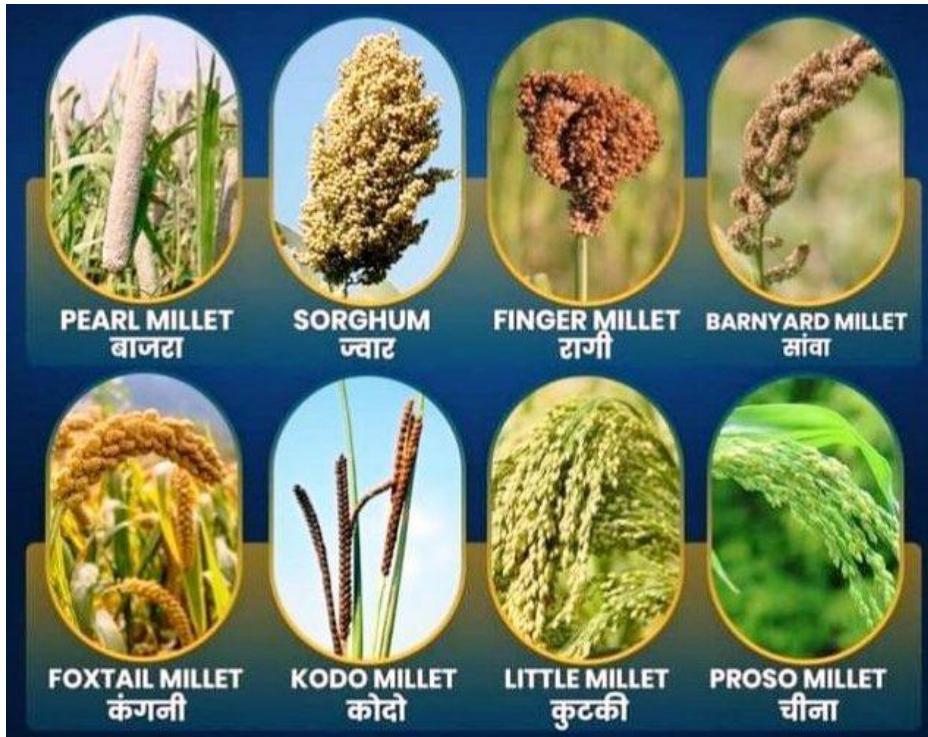
Fig1. Different types of Shree Anna