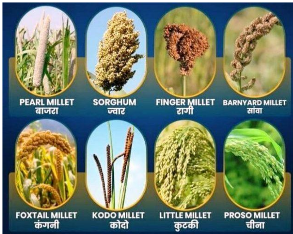
Figure- 1. Different types of Shree Anna