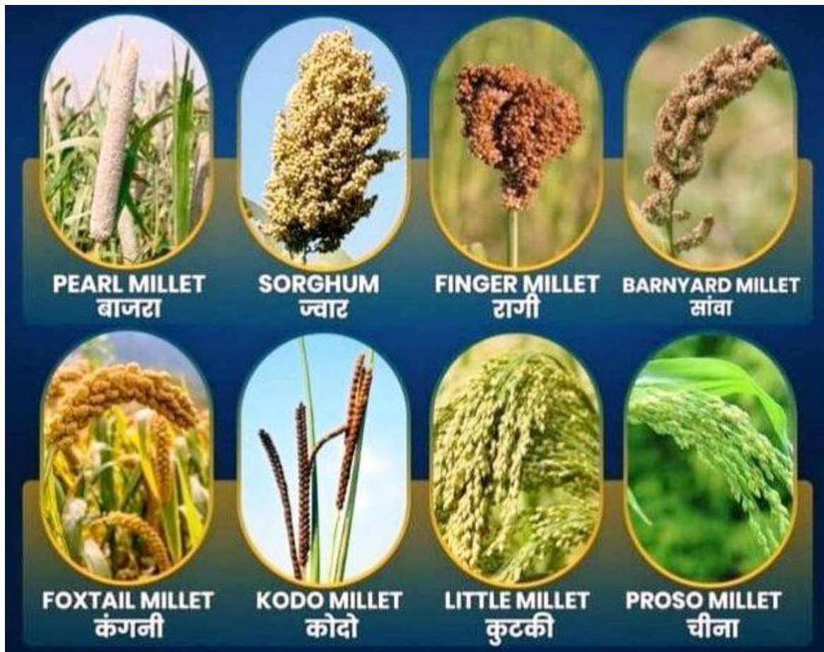
Figure- 1. Different types of Shree Anna