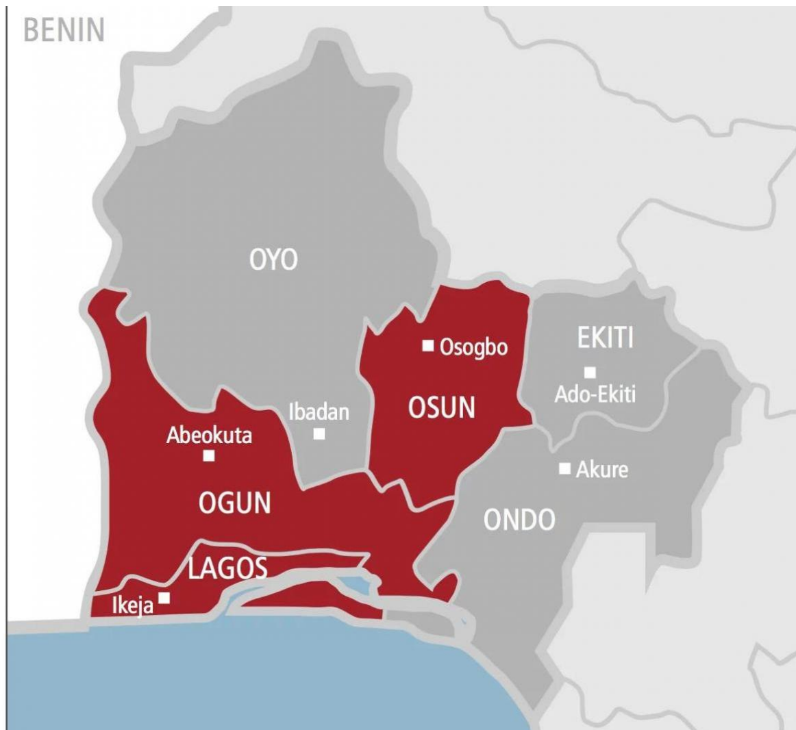
Fig. 1: Map of Southwest Nigeria