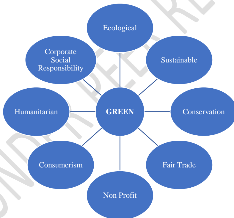
Fig2: Characteristics of Being Green (Peattie, 2001)

" Sustainable " green marketing was the third phase. It gained popularity in the latter stages of the 1990s and early 2000s as a result of its focus on creating high-quality products that can satisfy consumer needs while still being affordable, convenient, and environmentally friendly.