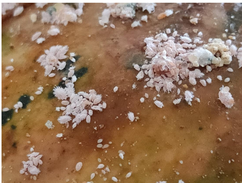
Fig. 1 Artificial rearing of D. brevipipes on pineapple for mass multiplication