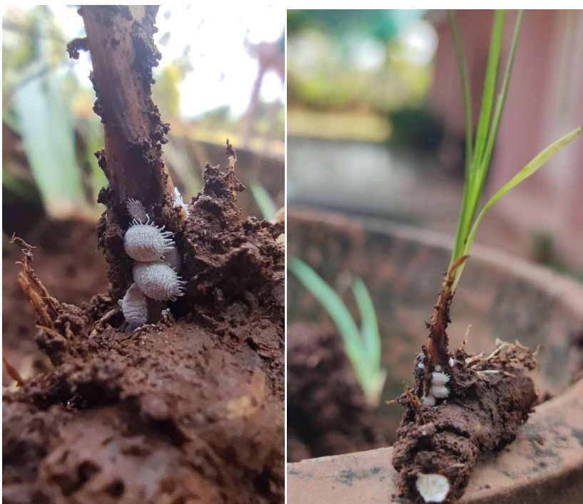
Fig 2 &3 : of D. brevipes attack on sweet flag