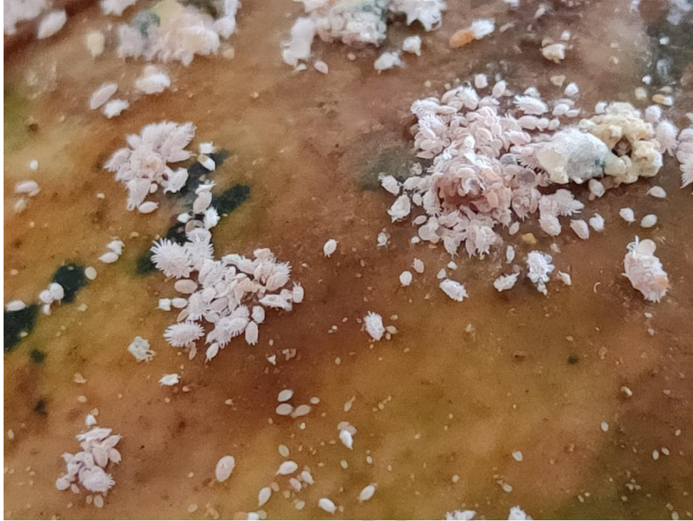
Fig. 1 Artificial rearing of D. brevipes on pineapple for mass multiplication