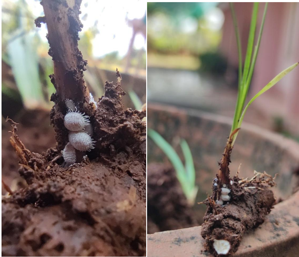
Fig 2 &3 : of D. brevipes attack on sweet flag