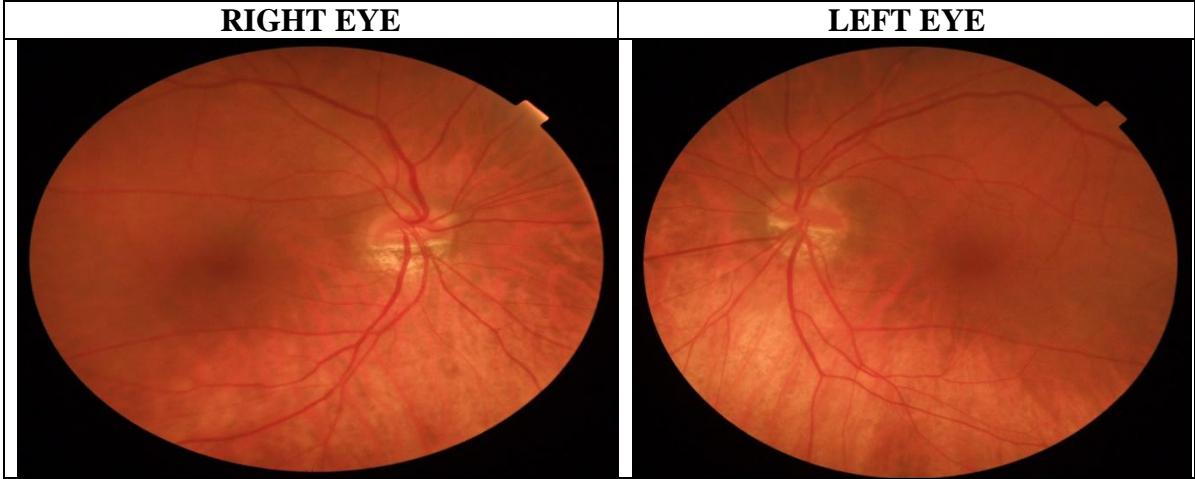
Figure 1: Retinophotography

An orbito-cerebral magnetic resonance imaging was performed to document the staphyloma and exclude an optic disc hypoplasia. The MRI confirmed the bilateral eyeballs staphyloma without any other issue (figure 2).