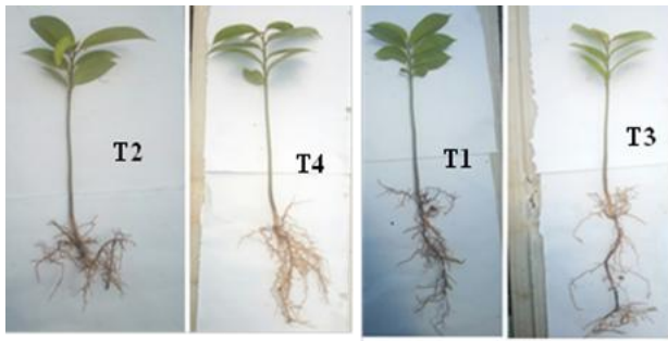
Fig. 5 Seedlings and their roots in ascending order