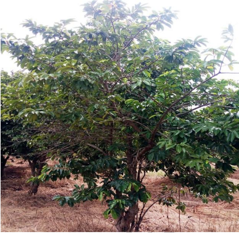
Fig. 1 Tree of soursop