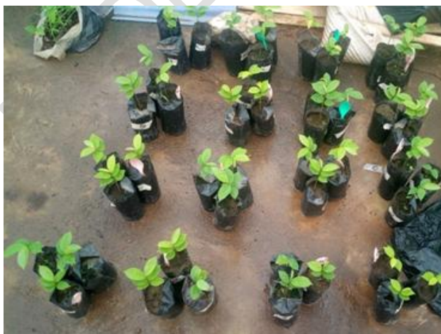
Fig. 4 Some seedlings of Annona muricata

Values were expressed as Mean \pm Standard Error. Mean values with different superscripts within the same column are significantly different ( P < 0.05 )