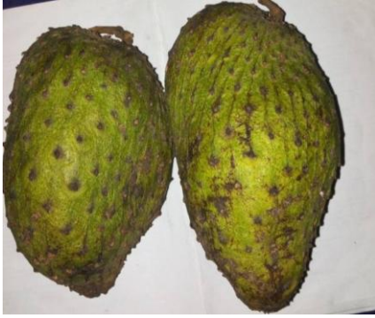
Fig. 2 Ripe soursop fruit

The objective of this study is to evaluate different organic potting media mixtures to determine their effects on the initial growth and development of Annona muricata seedlings. Meeting this objective will facilitate plantation establishment to keep up with the increasing demands for soursop fruits and products. It will also reduce the chances of endangering this ecologically and economically important species.