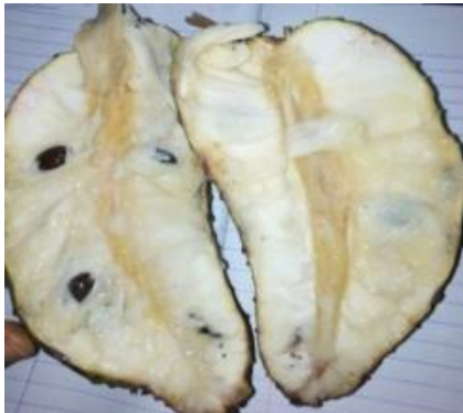
Fig. 3 White pulp of soursop showing seeds

The objective of this study is to evaluate different organic potting media mixtures to determine their effects on the initial growth and development of Annona muricata seedlings. Meeting this objective will facilitate plantation establishment to keep up with the increasing demands for soursop fruits and products. It will also reduce the chances of endangering this ecologically and economically important species.