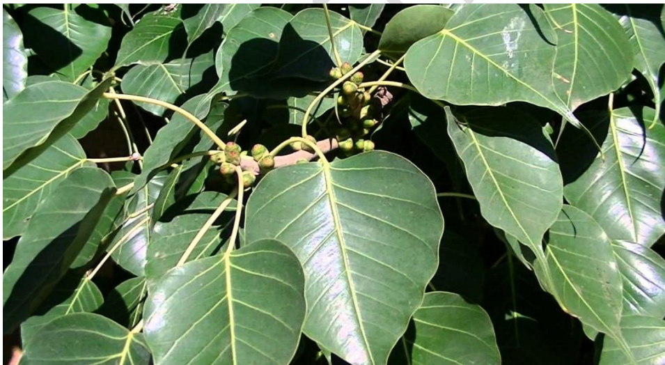
Fig No: 2 Ficus Religiosa leaves