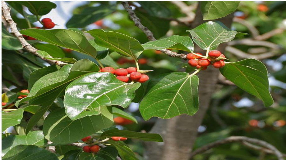
Fig No: 1 Ficus Benghalensis Leaves