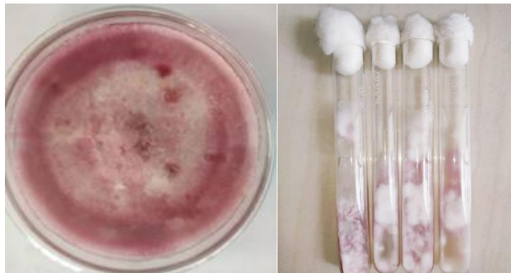
Figure 2: Pure culture of Fusarium culmorum in Petri plates and slants

The fungus cultures were transferred to Petri plates and PDA slants and incubated in the laboratory at a temperature of 28 \pm ^\circ\text{C} for 7 days. The original cultures were preserved at a temperature of 4^\circ\text{C} in a refrigerator. Additionally, these cultures were sub-cultured once a month and saved for future use.