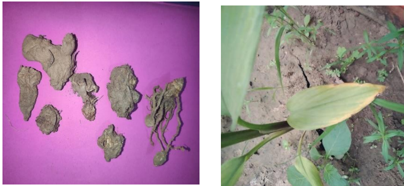
Figure 1: Infected rhizomes and leaves

The infected plants that displayed typical symptoms were gathered from the field, specifically the courtyard of the Department of Plant Pathology at SHUATS, Allahabad during the kharif season of 2023 to be identified. The initial symptoms were characterized by leaf yellowing, slight wilting, and stunting. As the infection progressed, the leaves would yellow and dry up, which are typical signs of crop maturity. Upon cutting open the infected rhizomes, the affected areas typically appear dull brown and dark in color. The affected rhizomes appear soft and shrunken, indicating the severity of the infection.