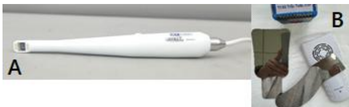
Figure 1. Intra-Oral Digital Camera GX-C300 (A); Intraoral mirror set (B).

2.2.4. Research Instruments: Intra-Oral Digital Camera GX-C300; Intraoral mirrors; Standard dental examination kit.