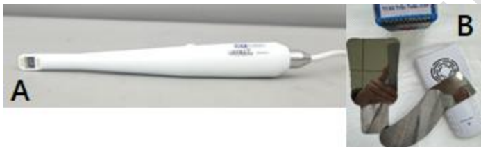
Figure 1. Intra-Oral Digital Camera GX-C300 (A); Intraoral mirror set (B).

2.2.4. Research Instruments: Intra-Oral Digital Camera GX-C300; Intraoral mirrors; Standard dental examination kit.