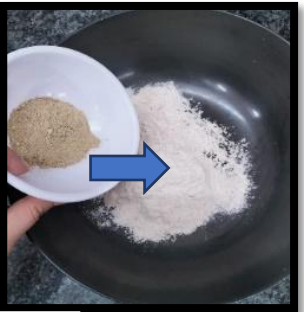
Addition of dry ingredients