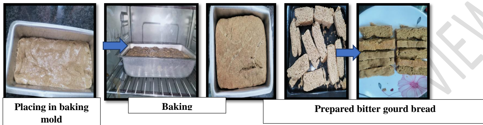
Figure 1 Unit operation for development of sugar free Bitter gourd powder Bread