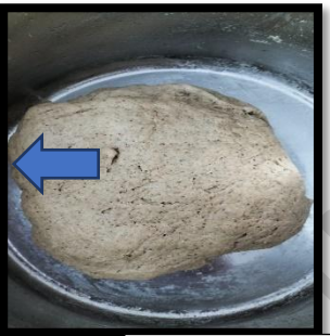
Kneading was done again and kept for fermentation (2h)