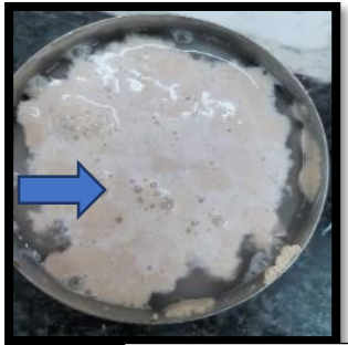
Addition of yeast in Lukewarm water