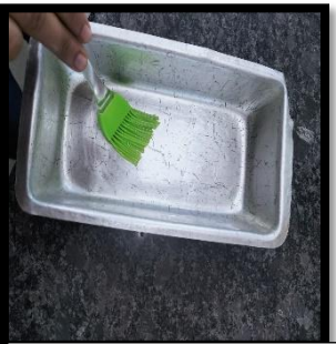
Greasing of baking mold