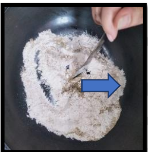
Mixing of dry ingredients