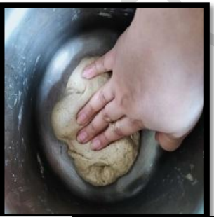
Kneading of dough and kept for 1h