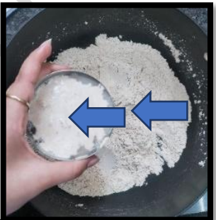
Addition of Activated Yeast