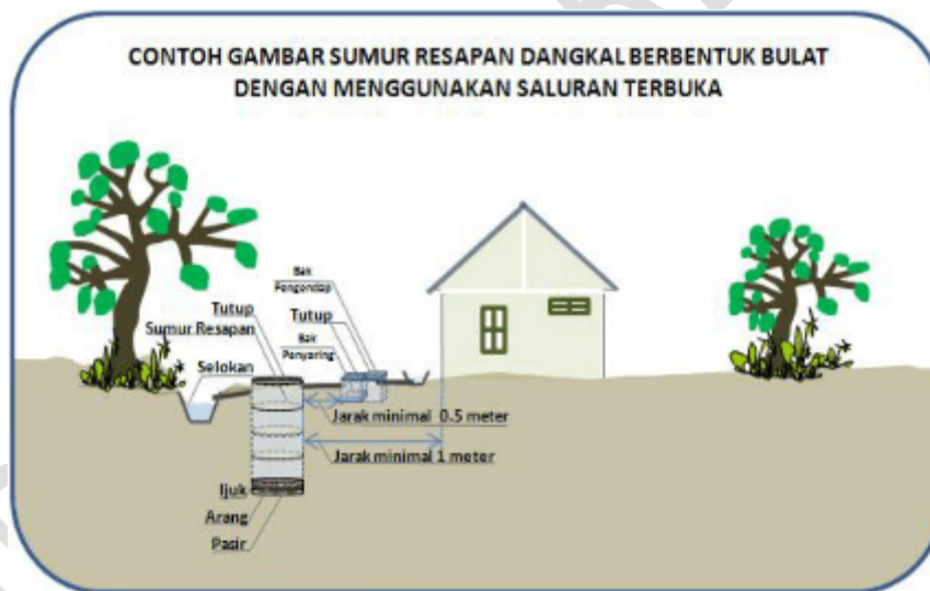
Figure 3. Infiltration Well 2 (Example of A Picture of A Shallow, Round Infiltration Well Using an Open Channel)