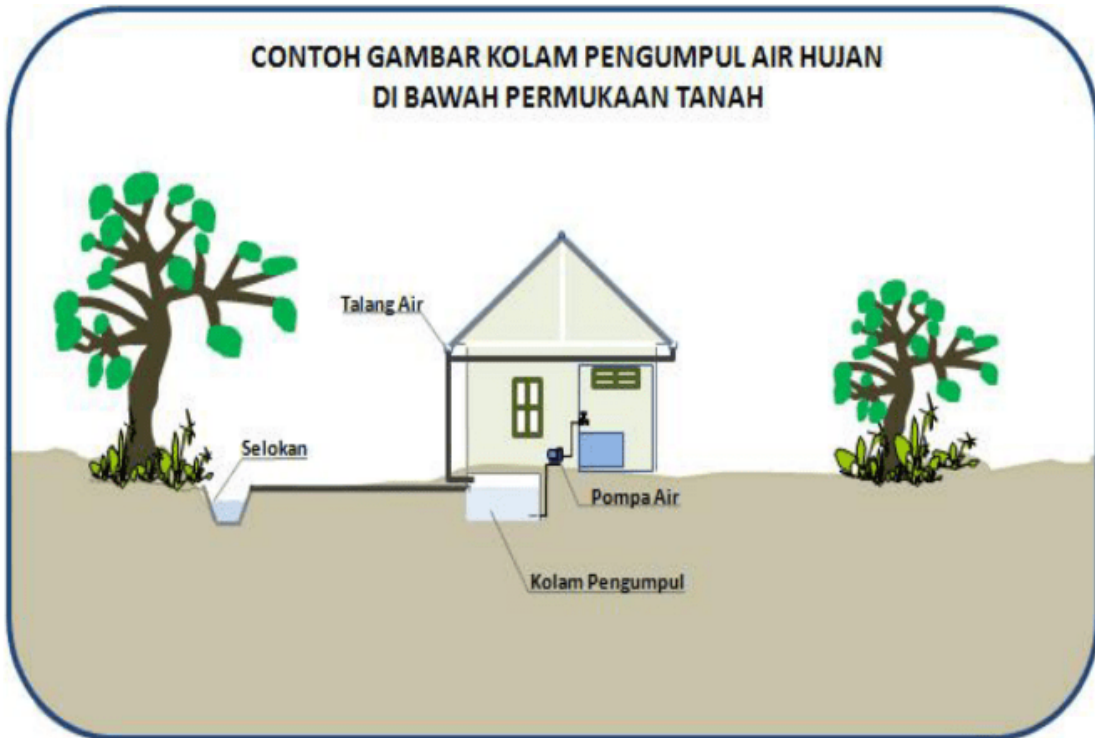
Figure 4. Rainwater Collection Pond 1 (Example of a Picture of a Rainwater Collection Pond BelowGround Level)