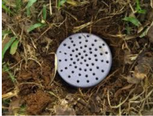
Figure 6. Biopore Absorption Holes

Biopore infiltration holes are holes made perpendicularly (vertically) into the ground, with a diameter of 10 – 25 cm and a depth of around 100 cm or not exceeding the depth of the groundwater table. Technically, biopore holes are similar to infiltration wells, only their diameter is much smaller. This is what the term Bioporimight be used for.