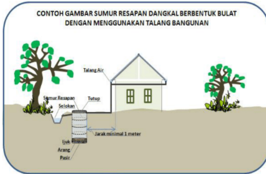
Figure 2. Infiltration Well 1 (Example of A Picture of A Shallow, Round Infiltration Well Using A Building Gutter)