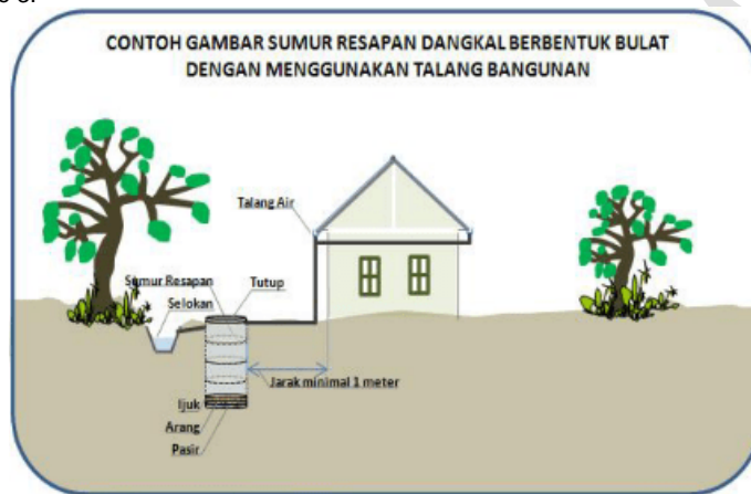
Figure 2. Infiltration Well 1

Infiltration wells are holes made to absorb rainwater into the soil and/or water-bearing rock layers. Currently, various types or models of infiltration wells have been developed, such as open and closed channel infiltration wells. For the general public, infiltration wells can also be built in yards, guided by SNI No.03-2453-2002 concerning technical planning procedures for rainwater infiltration wells for yards in Figure 2 and Figure 3.