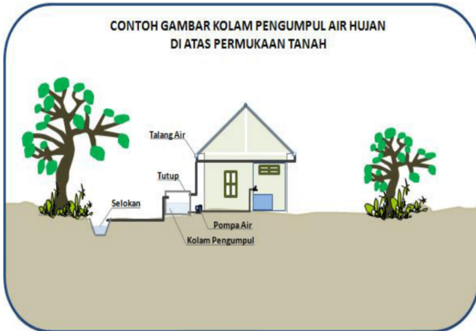
Figure 5. Rainwater Collection Pond 2