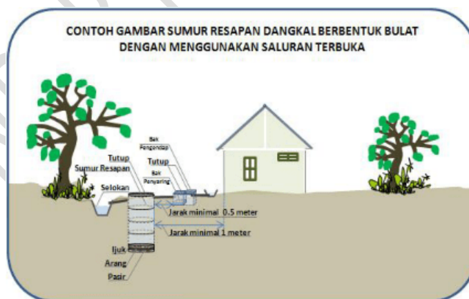
Figure 3. Infiltration Well 2