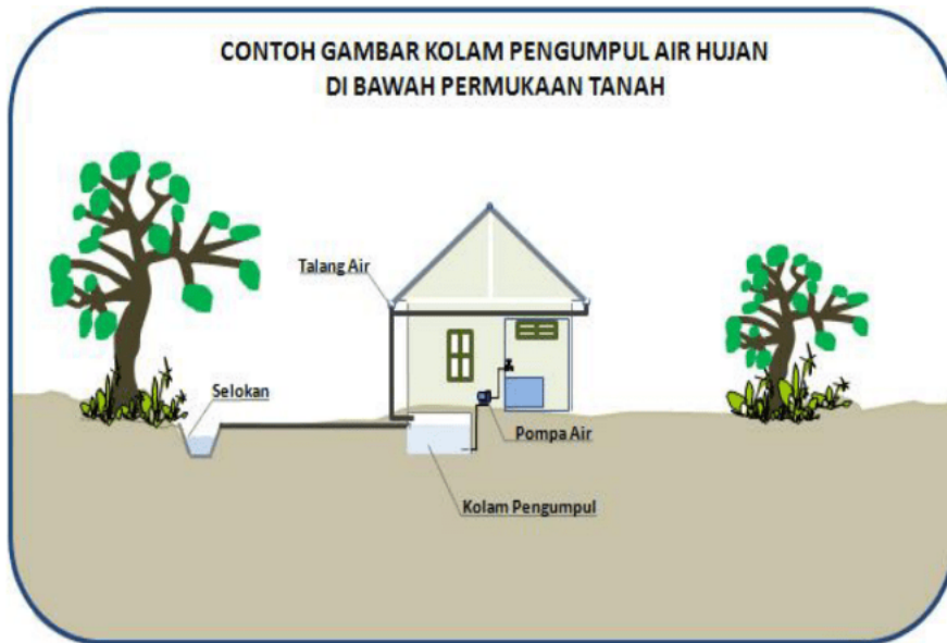
Figure 4. Rainwater Collection Pond 1

A rainwater collection pond is a pond or container used to collect rainwater that falls on the roof of a building (house, office, or industrial building) which is channeled through gutters. In principle, this pool is not much different from a Detention Pool, which should have a filtering and processing or soil absorption system, as referred to in Ministerial Decree 11/2014 [10]. Examples of images of rainwater collection ponds are presented in Figure 4 and Figure 5.