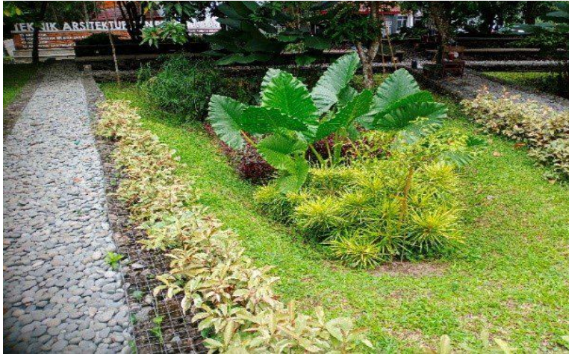
Figure 6. Rain Garden 1