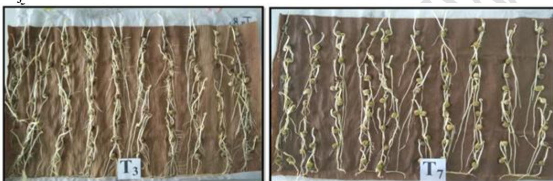
Plate 2: Germination (%) of harvested seed in treatments T 3 and T 7

On the other hand, iron is essential for the formation of important structural components like cytochromes, hemes, hematin, ferrichrome and leghemoglobin, which are involved in oxidation-reduction reactions during respiration and photosynthesis. These factors may have contributed to increased seed weight, while the presence of auxin likely promoted the growth of both shoots and roots. Moreover, the foliar application of iron and zinc provided an ample supply of nutrients for optimal seed growth. Similar findings regarding root length have also been reported by Kiran (2006) in case of brinjal.