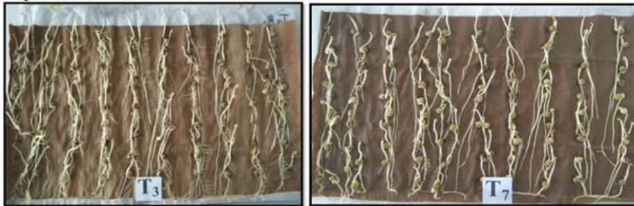
Plate 2: Germination (%) of harvested seed in treatments T 3 and T 7