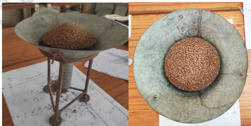
Fig.2. Measurement the angle of repose for granular fertilizers