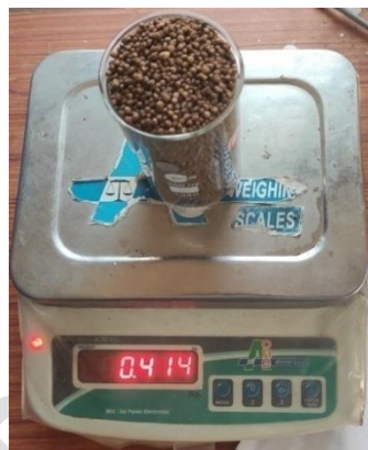
Fig.3. Measurement the bulk density for granular fertilizers