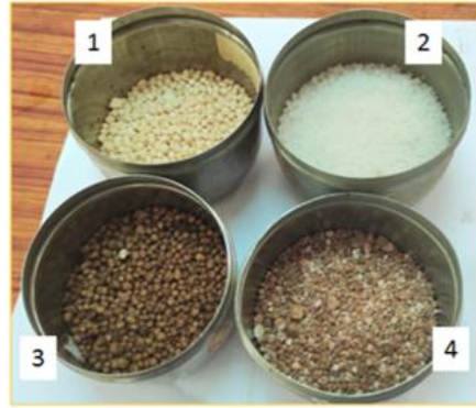
1) APS 2) Urea 3) Complex fertilizer and 4) NPK Mixture