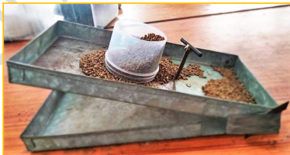
Fig.4. Measurement the coefficient of friction for granular fertilizers

N = Normal force (weight of the fertilizer), kg.