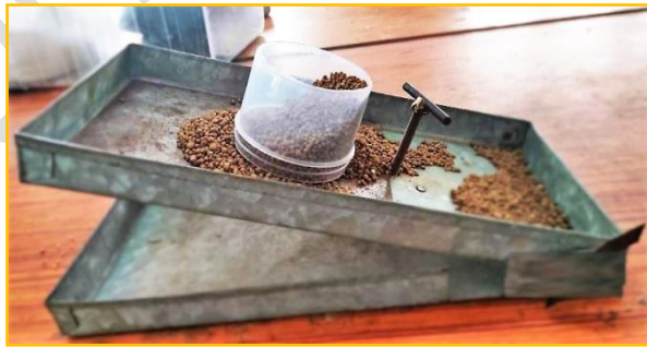
Fig.4. Measurement the coefficient of friction for granular fertilizers

N = Normal force (weight of the fertilizer), kg.