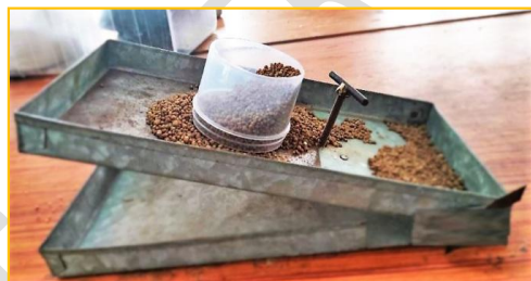
Fig.4. Measurement the coefficient of friction for granular fertilizers