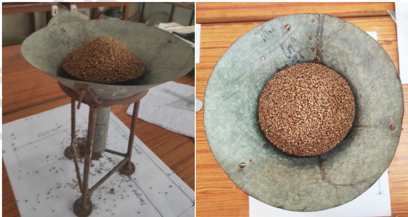
Fig.2. Measurement the angle of repose for granular fertilizers

Comment [A24]: Consider the place of figures in the text in its right place