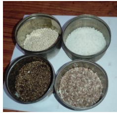
Fig.1. Four different types of fertilisers for measurement the physical properties

Comment [A22]: Consider the place of figures in the text in its right place