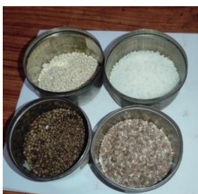
Fig.1. Four different types of fertilisers for measurement the physical properties