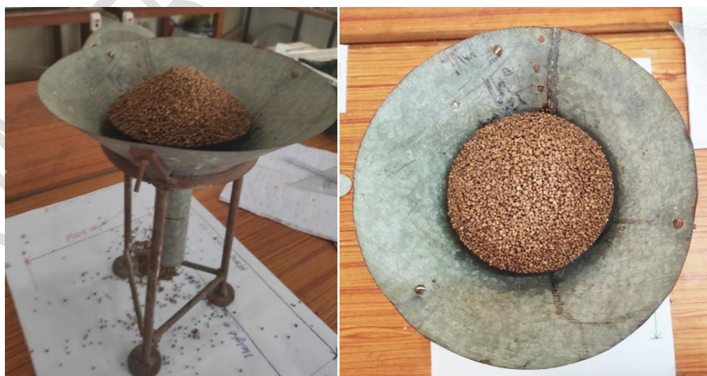
Fig.2. Measurement the angle of repose for granular fertilizers