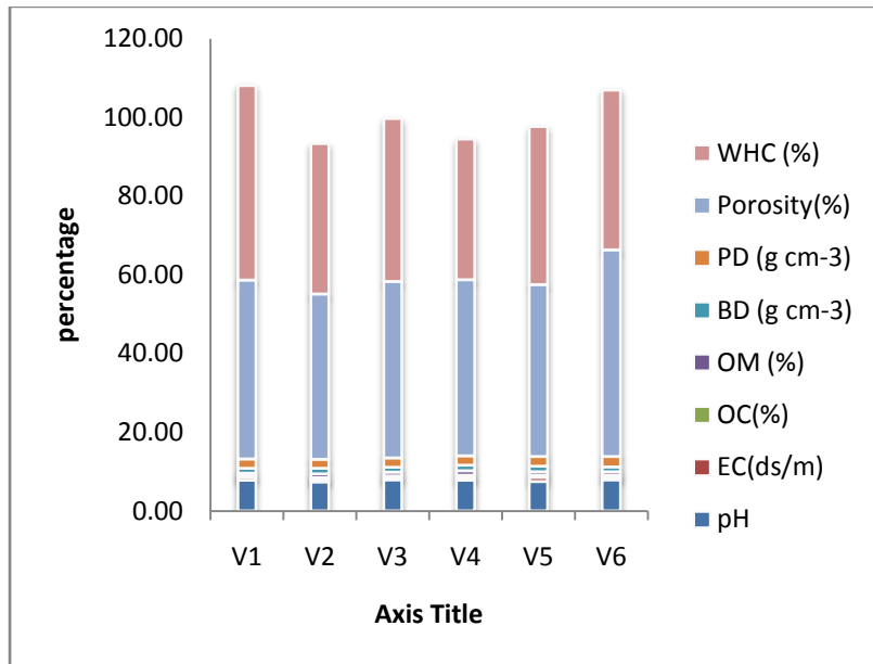
Fig. 2. Soil physio-chemical parameters of different villages of Malpura Block