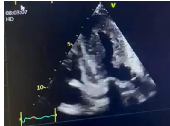
Image 1: Apical section showing significant LVH therefore the IVS/PP ratio: 1.3

As per international standards or university standards, patient(s) written consent has been collected and preserved by the author(s).