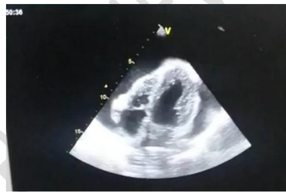
Image 2: 4-cavities subcostal section showing very abundant pericardial effusion