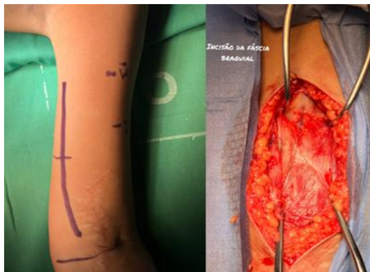
Fig.1: Supine position with the arm abducted and externally rotated. Forearm extended in supination (left). Incision of the brachial fascia (right).

appropriate technique, being the procedure performed, involving neurotomy of the lateral cutaneous nerve as the donor to the median nerve as the recipient. The patient presented a good prognosis and recovered protective sensitivity in the pincer region. Below, there are images depicting the procedure.