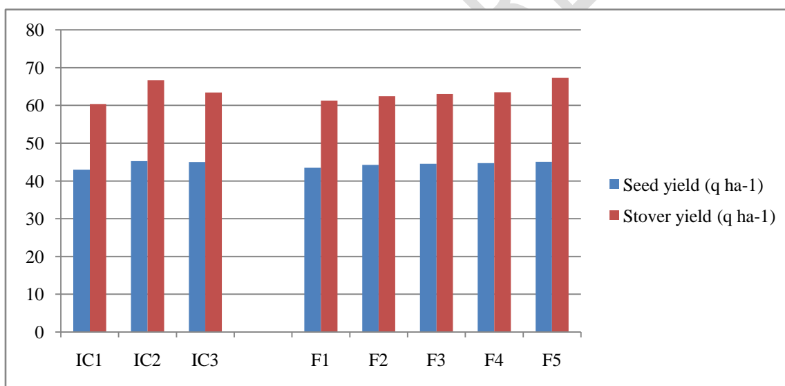
Fig.2. Effect of different fertilization on yield parameters of maize with cowpea intercropping.

The intercropping IC1 (5:1), IC2 (2:1), IC3 (3:1). The fertilizer levels F1 : 100% RDF, F2 : 75% RDF +10 t FYM ha -1 , F3 : 50% RDF +5 t FYM ha -1 + 2 t VC ha -1 , F4 : 50% RDF +5 t FYM ha -1 + 2 t PM ha -1 , F5 : 50% RDF +5 t FYM ha -1 + 2 t VC ha -1 + 2 t PM ha -1 .